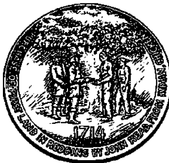
EXHIBIT 6 Mark Lubus 2/17/2022